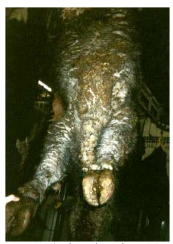
Figure 1: Excessive dag adhering to the coat will not only make hide opening difficult, but also lead to carcase contamination

As a result of the association between dirty hides and high carcase microbiological counts, some countries have introduced a 'clean livestock' policy, and use a subjective rating system for assessing the cleanliness of cattle presented for slaughter. Although mobs of cattle that are scored 'cleaner' will tend to give lower carcase microbial counts, there does not seem to be a consistent relationship between cleanliness score for an individual animal and its own carcase microbial load. However, the scores within each sale lot tend to be similar, and this makes the system a useful tool.